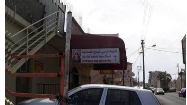
New Church Plant in Nazareth