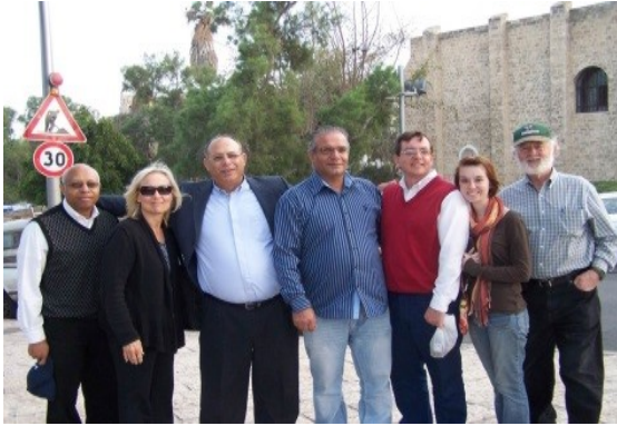
UCAIM with Potential House Church Host in Jappa