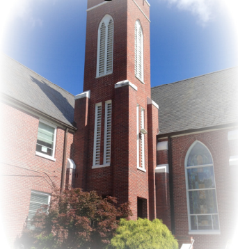
Loris First Baptist Church Loris, South Carolina

When people tell me they are into Jesus but not into doctrine, I tell them that if they are not into doctrine, they are, in fact, not into Jesus. We cannot know Jesus without knowing doctrine, and we cannot love God without knowing God, and the way we know God is by studying His Word. Doctrine comes from God, it teaches us about God, and by faith it leads us back to God in worship, service, and love. Indifference to doctrine is indifference to God, and indifference to God is indifference to our own eternity. Pastors who think it is relevant and cool to be indifferent about doctrine—who play down the necessity and importance of doctrine and who fail to preach and explain doctrine in their sermons—are in fact failing to give their people that which will save their souls. For us to downplay doctrine or to be intentionally fuzzy in preaching doctrine isn't cool or humble or relevant, it's outright arrogant. There is nothing more relevant than doctrine, there is nothing more humbling than doctrine, and there is nothing that more quickly gets our eyes off ourselves and fixes them on our loving and gracious God than doctrine that proceeds from God.